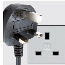
Type G Socket