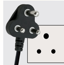
Type D Socket

https://www.worldstandards.eu/electricity/plugs-and-sockets/